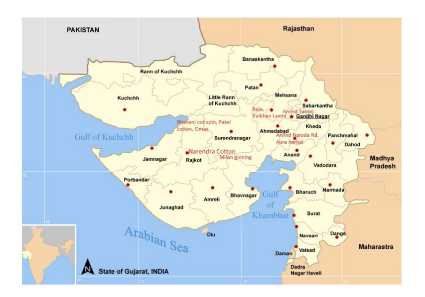
Figure 1: Location of the ginning factories surveyed on a map of Gujarat

In line with the structure of the questionnaire on which the interviews were based, the following statements sum up the results of the survey among 101 interviewees, as well as those of the two group discussions. The summary table with which each section closes (from Ch. 2.2 onwards) provides a company-specific overview of the workers' responses.