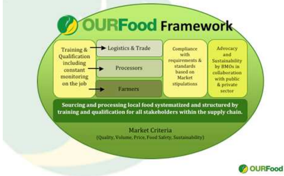
Illustration: an overview of the work of OURFood

The analysis of market requirements informed the programme's guidelines: